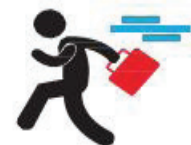
Subscribers Rush to Help Victim Before EMS Arrives