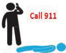
Sudden Cardiac Arrest Victim in Need