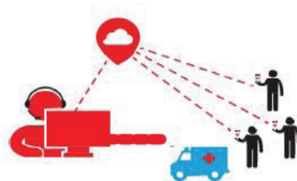
911 System Sends PulsePoint Alert