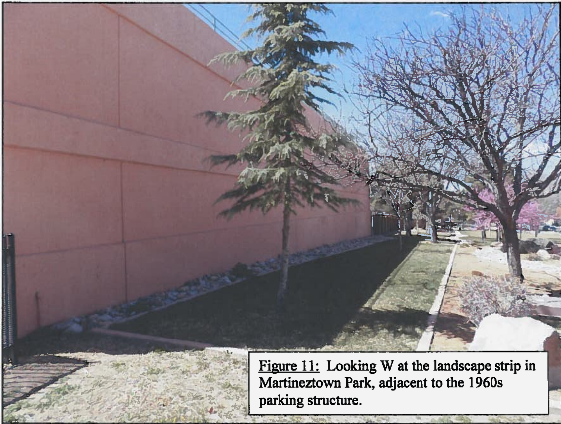
Figure 11: Looking W at the landscape strip in Martineztown Park, adjacent to the 1960s parking structure.