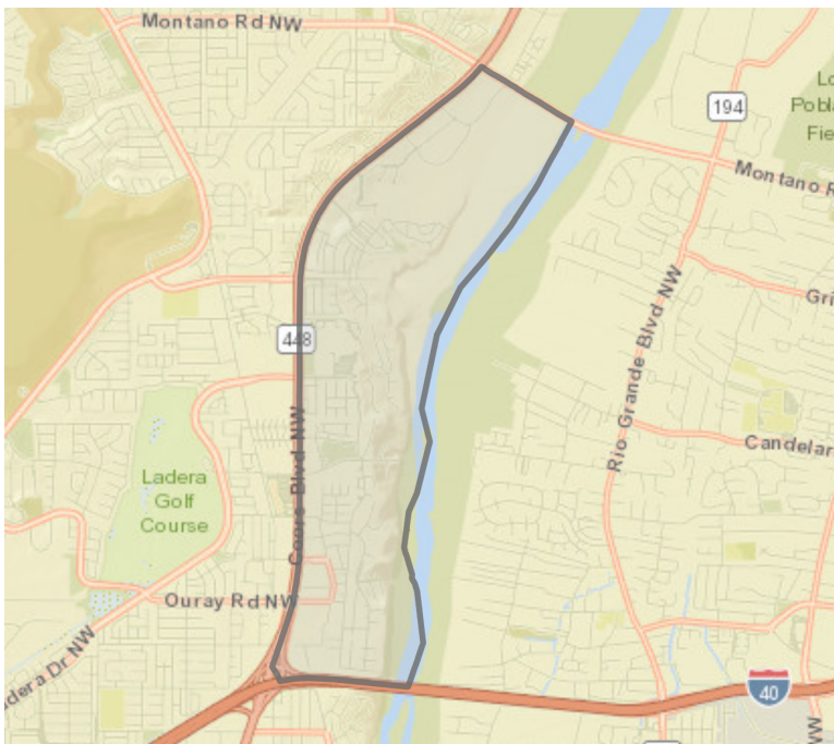
POPULATION BY AGE