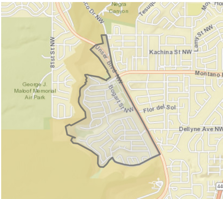
POPULATION BY AGE