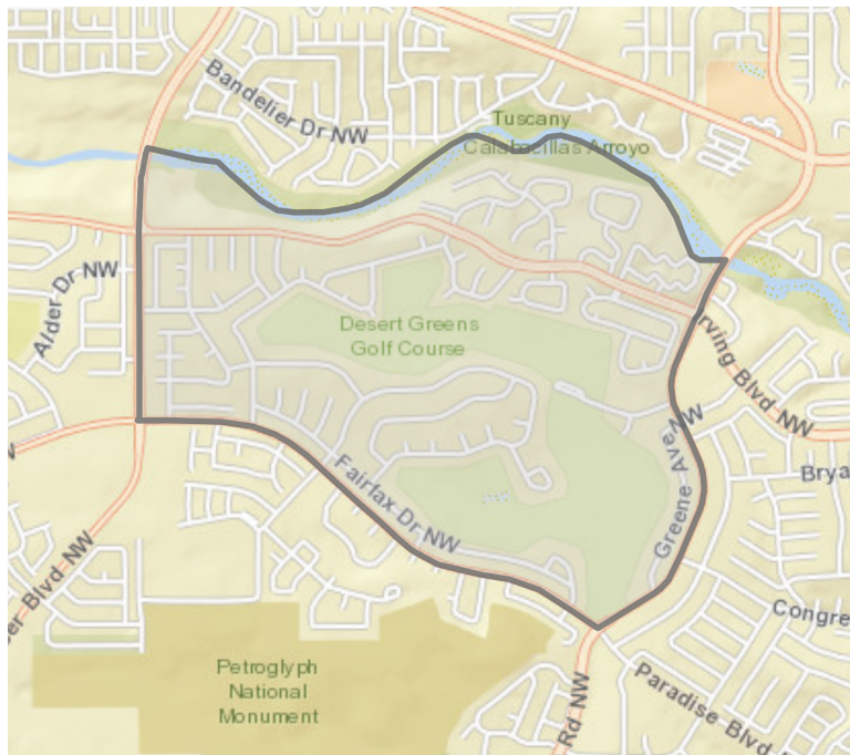
POPULATION BY AGE