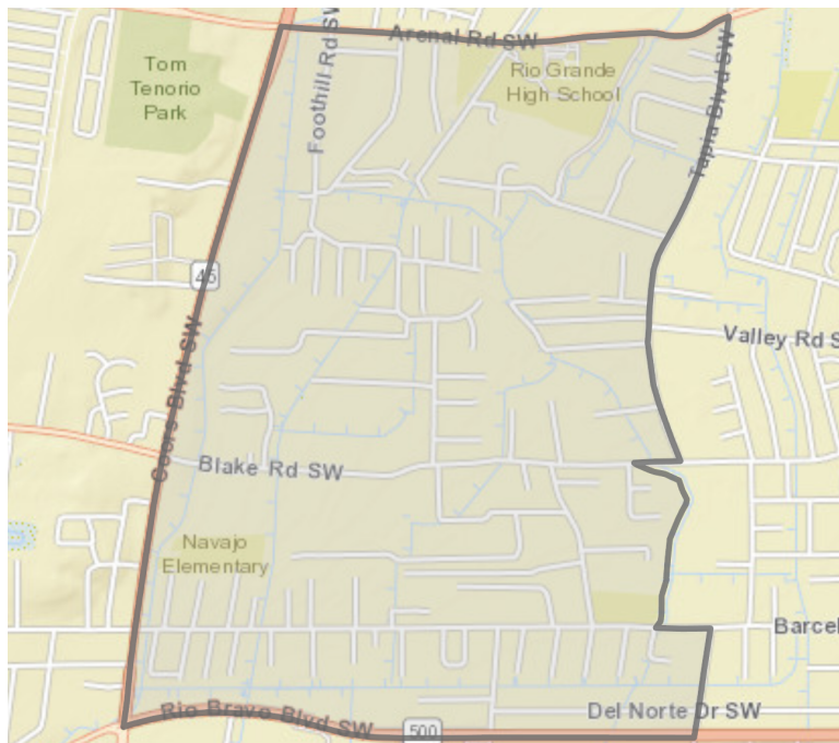
POPULATION BY AGE