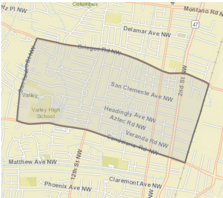
POPULATION BY AGE