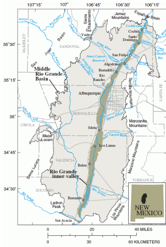
Figure 13-3: Major Physiographic and Hydrologic Features of the Middle Rio Grande Basin

As of 2016, the New Mexico Water Resources Research Institute is developing estimates of riparian evapotranspiration for the Office of the State Engineer. It is anticipated to consume a relatively large quantity of water statewide, and this may increase in the future due to warming temperatures. In the Middle Rio Grande region, the updated water budget estimated that riparian evapotranspiration in recent years was about 150,000 acre-feet per year. The region may choose to incorporate specific instream flow protections in future planning.