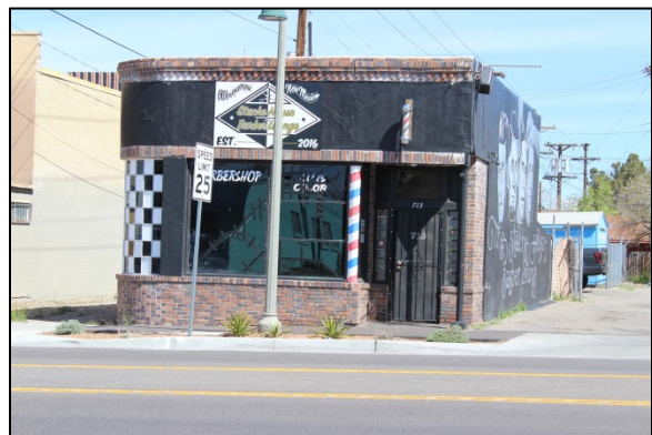
Broken windows and deteriorating building facades