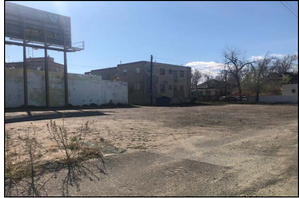
Vacant properties with high redevelopment potential