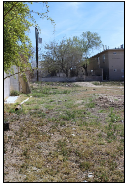
Trash and debris on vacant property