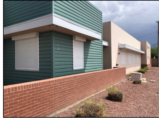
Closed businesses and inactive storefronts along Central Avenue and Broadway Boulevard