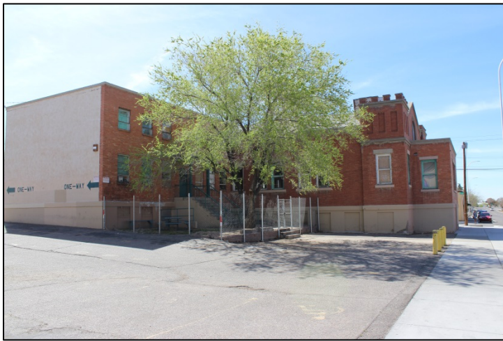
Vacant and deteriorating building fronting Broadway Blvd.

As some of the oldest neighborhoods in the City, the East Downtown, Huning Highlands and South Martineztown communities have transformed and evolved over time. The built environment grew and responded to many factors including the diminishing role the railway in the city, an increased use of the automobile, the construction of Interstate 25 along the eastern portion of the neighborhoods, and the outmigration of businesses and residents of the downtown core. Because the Proposed Area experienced these changes, there are properties with deteriorating site improvements that are outdated or unusable in the current marketplace. These deteriorating site improvements have potential for redevelopment opportunities or adaptive reuse solutions that can modernize the structures and provide new activity to the community and local economy. Sites were observed with remnants of structures, trash and debris from past activities and damaged and decaying buildings.